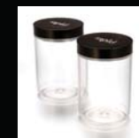
Rapid Cup w/lid Twin Pack TE201260