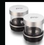
Pro v Cup w/lid Twin Pack TE201207