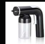
Rapid Applicator TE201070