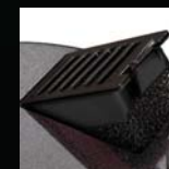
Pro v Turbine Filter TE201460