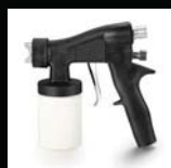
Studio Tan Applicator TE201040