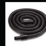
Pro v Hose TE201107