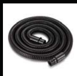
Studio Tan Hose TE201140