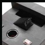
Studio Tan Filter TE201460