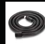
Rapid Hose TE201160