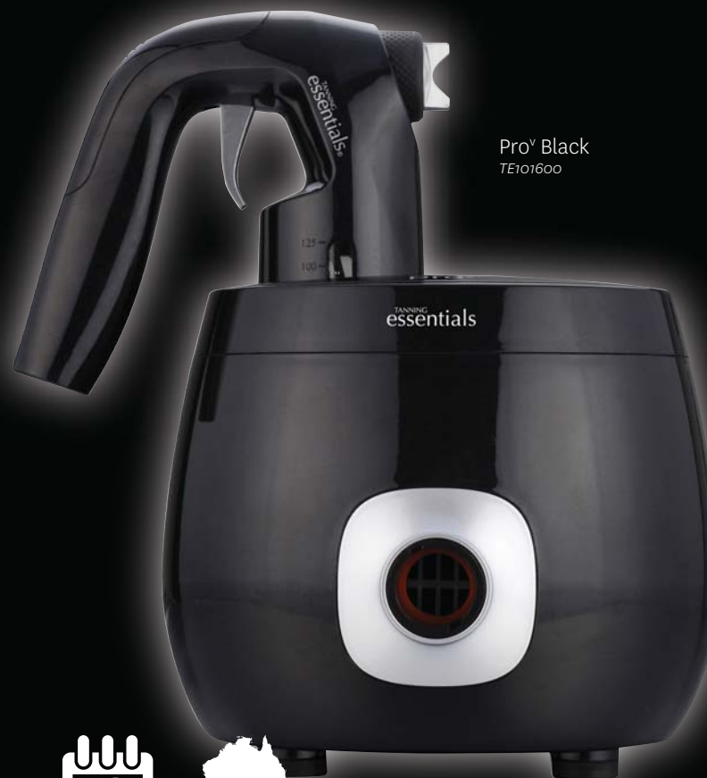
Pro v Black TE101600