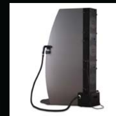
Spray Station Back