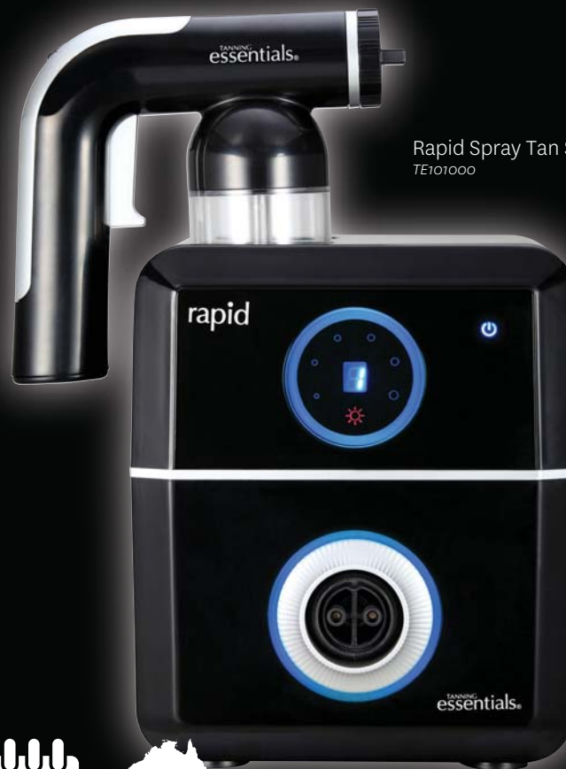
Rapid Spray Tan System TE101000