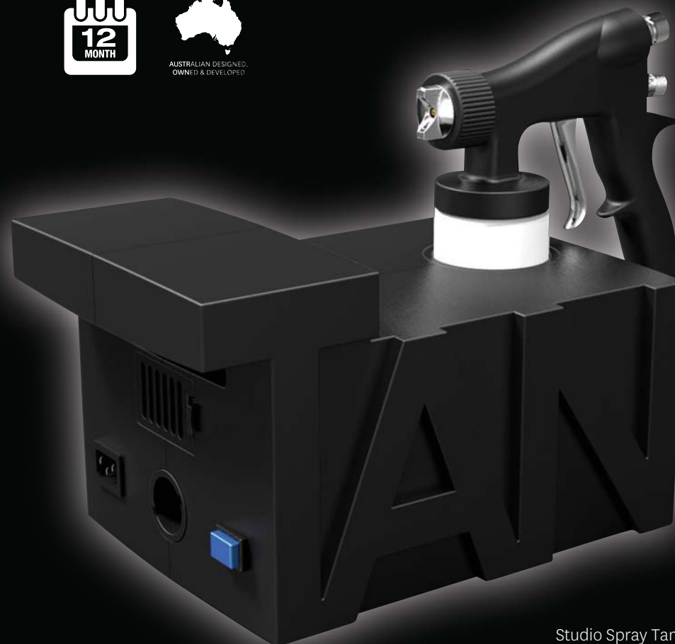
Studio Spray Tan System TE101400