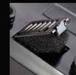
Rapid Turbine Filter TE201460