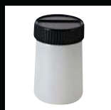
Studio Tan Cup TE201240