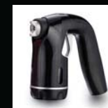
Pro v Black Applicator TE201020